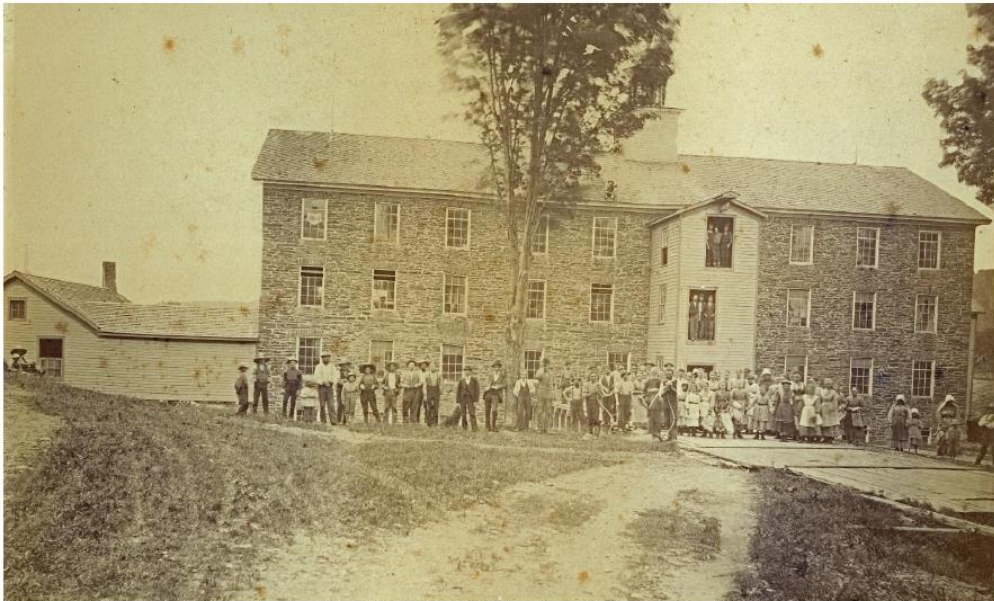
Butternut Woolen and Cotton Factory, East River Road, Morris, circa 1850